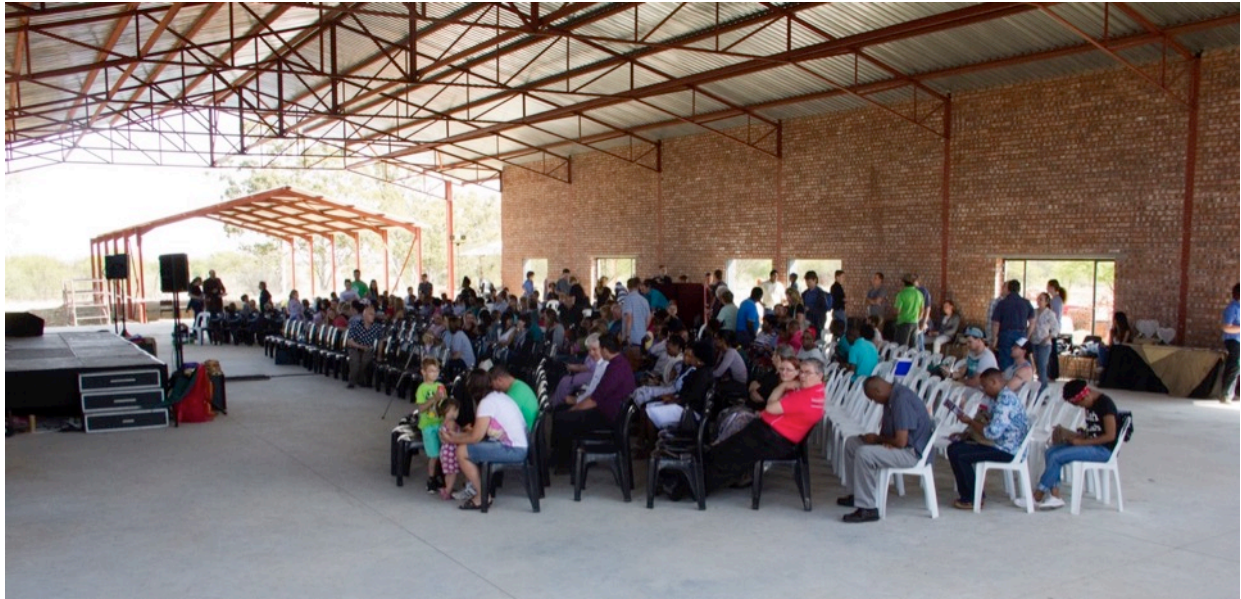
Parents and guests attend the AGM (annual general meeting,) in the hall structure, in October 2016.