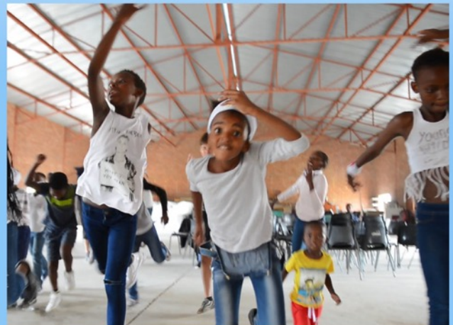
LEARNING DANCE SKILLS IN THE HALL