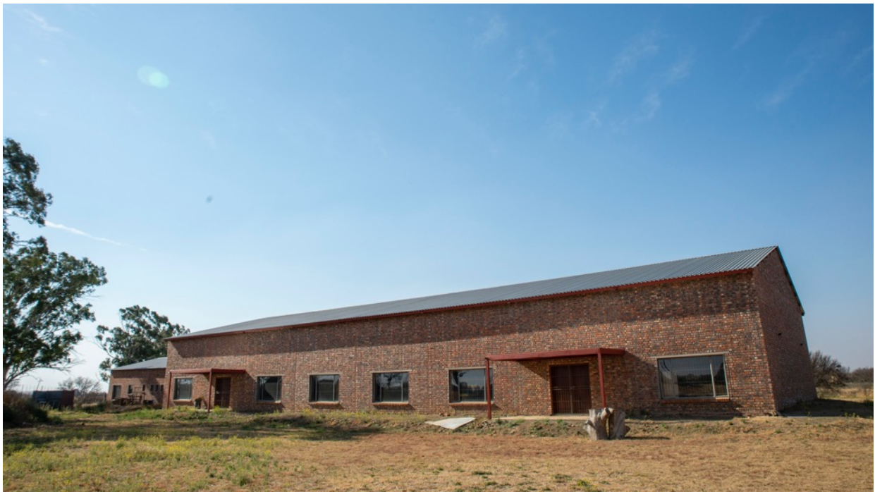
School buildings as of August 2019.