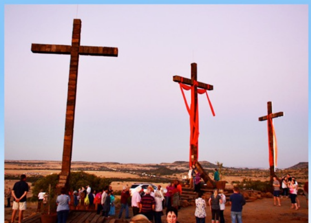
CROSSES ON SCHOOL FARM DURING "IT'S TIME"