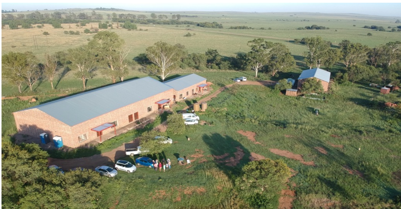
Current progress of facilities.