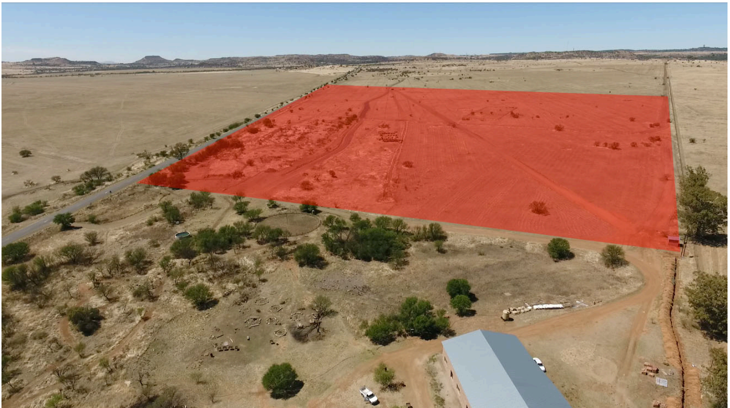
Space for sports fields and future expansions at the new school premises.