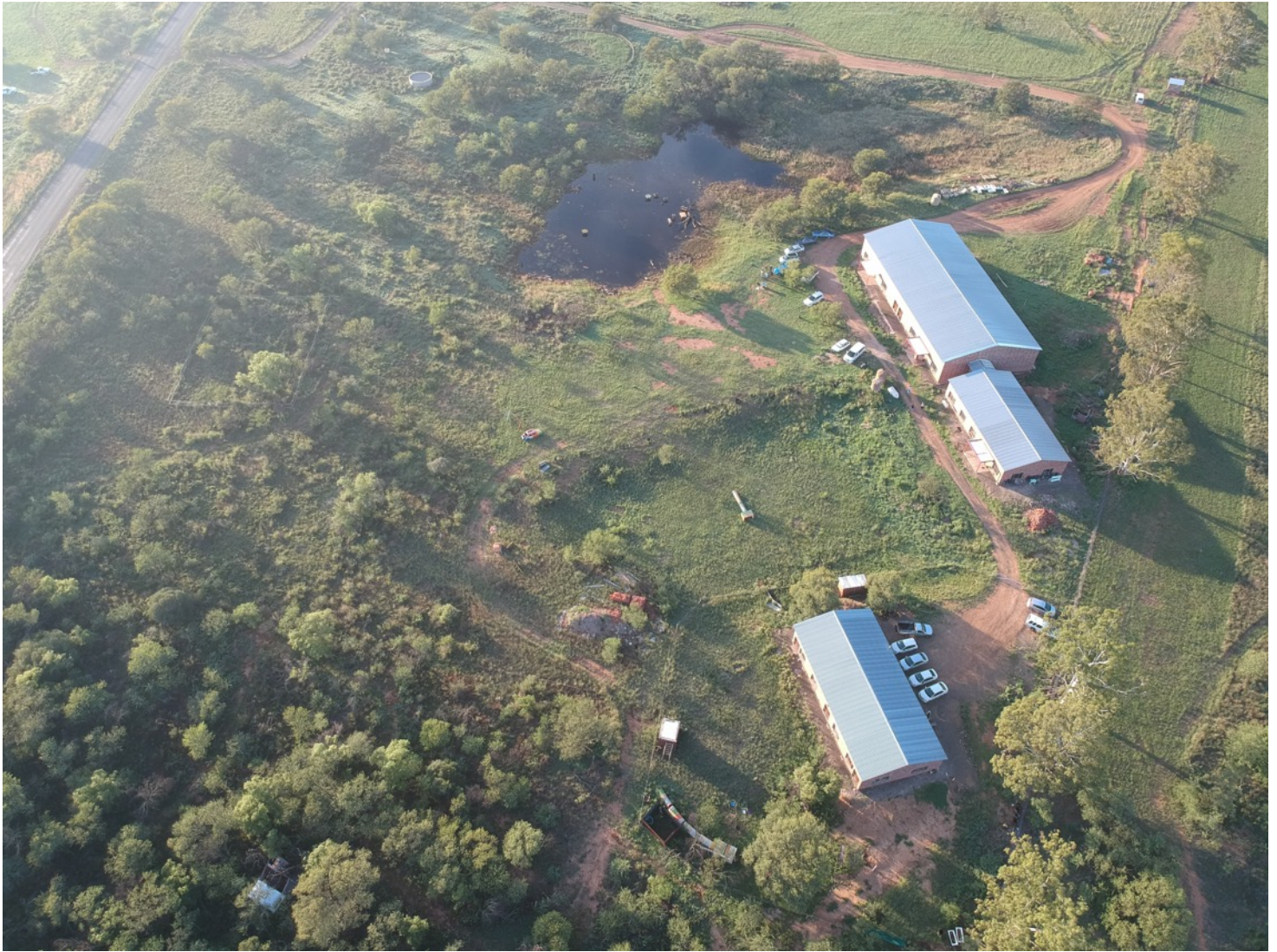
Current development at the new school premises.