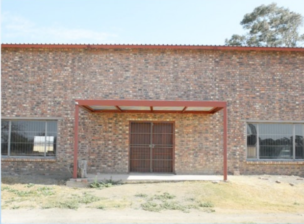
ENTRANCE DOOR AWNINGS