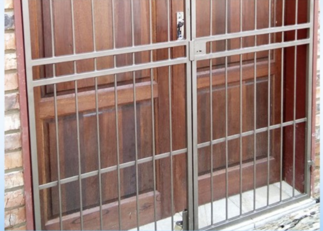
COMPLETE BURGLAR PROOFING